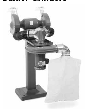
Catalog #1022W with DC10 and GA16