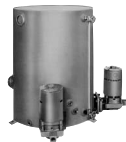
Series VBF Duplex Design