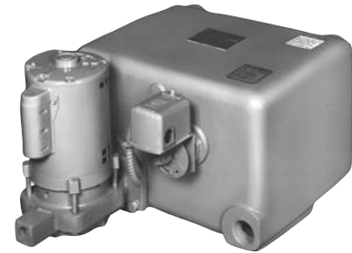
Series WC and WCS Simplex Design

For more details and information about sizing and selection of Domestic Pump condensate equipment, contact your local ITT Bell & Gossett Representative listed on the back cover of this catalog.