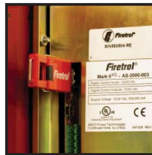
USB Host Port and Flash Disk

The controller is equipped with a built-in USB Host Controller. A USB port capable of accepting a USB Flash Memory Disk is provided. The controller saves all operational and alarm events to the flash memory on a daily basis. Each saved event is time and date stamped. The total amount of historical data saved depends on the size of the flash disk utilized. The operator can save settings and values to the flash disk on demand via the user interface.