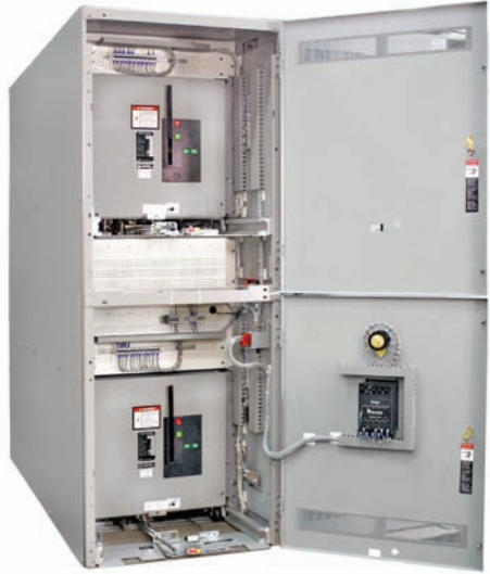
Series 977 Medium Voltage Power Transfer System, single section