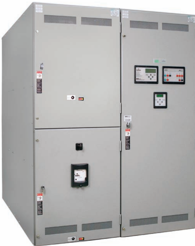
ASCO Series 977 Medium Voltage Power Transfer System

While ASCO Medium Voltage Power Transfer Switches are functionally similar to low voltage transfer switches, they use a pair of medium voltage circuit breakers rather than an ASCO solenoid operating mechanism. An ASCO 7000 Series Power Control Center manages the breaker operation to transfer critical loads between power sources.