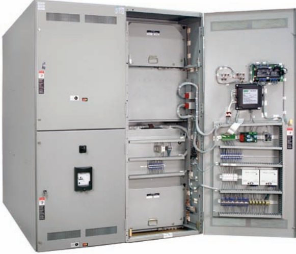
Series 977 Medium Voltage Power Transfer System, two-section enclosure with right door open

The ASCO Series 977 Medium Voltage Automatic Transfer System provides high reliability and ease of maintenance. This model complies with requirements of the: