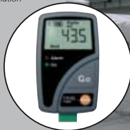
Logging of current and voltage during production processes with testo 175-S2