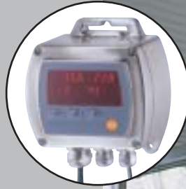
hygrotest humidity transmitter

By the way: 98% of our training participants fully recommend our seminars and training.