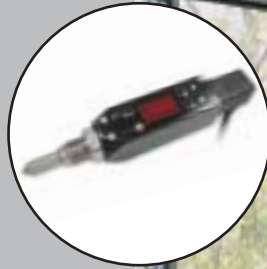
Trace humidity measurement in compressed or dry air with testo 6740