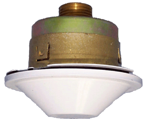
WHITE CONCEALED PENDENT