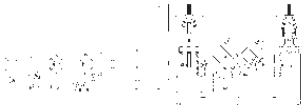
See page 52 for air gap drain information.