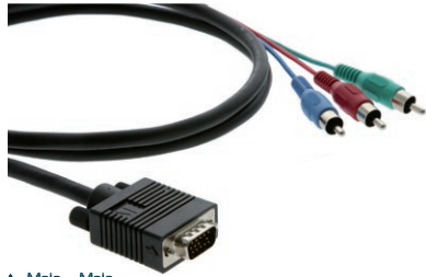
▲ Male - Male

Kramer's computer graphics video to component video breakout cables are constructed from 3 mini coax cables with a 15-pin HD (M) connector at one end and 3 RCA (M or F) connectors at the other. These cables send or receive computer graphics video or component video signals.