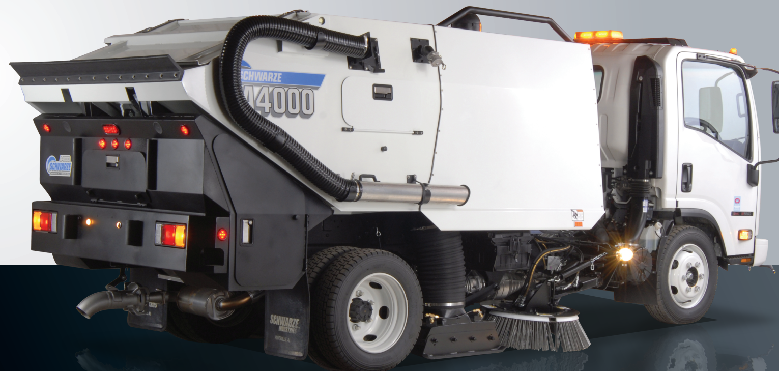
Model shown with optional equipment.

Easy To Maneuver Highly Efficient No CDL Required