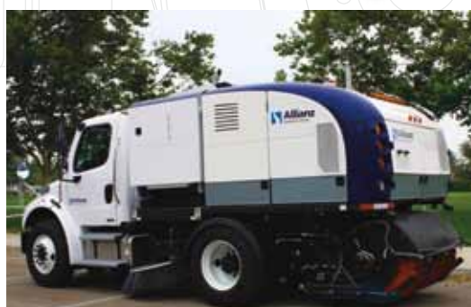
MS/MT350 Mechanical Sweeper

The Allianz Johnston MS/MT350 is a high-performance rugged sweeper offering total dependability and sets the global benchmark for truck-mounted sweeper quality.