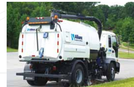
VT 650/800 Vacuum Sweeper

The Allianz Johnston RT655 offers features that are unmatched in the industry.