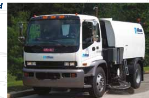
RT655 Regenerative Sweeper

The Allianz LT500 is the most reliable method for quick and efficient trash collection.