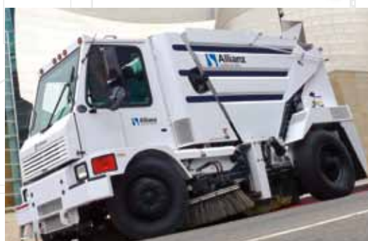
4000 Mechanical Sweeper

The Allianz Johnston 4000 is a high-performance sweeper that offers unmatched reliability, safety and ease of use.