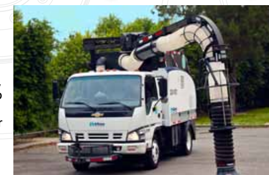
LT500 Litter Collection System

The World's Leading Manufacturer of Outdoor Surface Cleaning Equipment