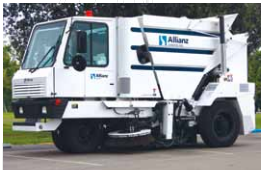
3000/IMX Mechanical Sweeper

The Allianz Johnston 3000/IMX three-wheel sweeper sets the standard for street sweeper equipment.