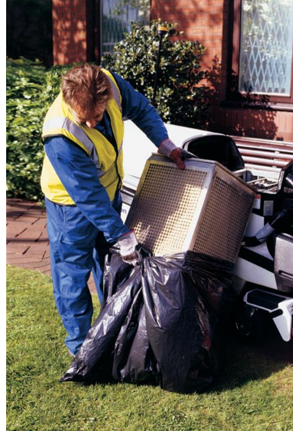
RIGHT Hydraulic side dump