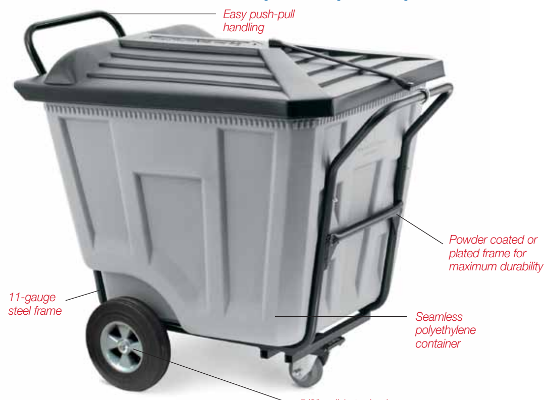
5/8" solid steel axles

Medium- and Heavy-Duty Poly-Kart containers provide safe, clean and cost-effective methods for transporting waste, bulk materials and work-inprogress components.