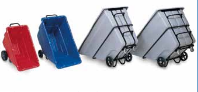
4 sizes - .5, 1, 1.5, 2 cubic yards.

Leasing programs are available on all material handling carts listed.