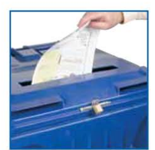
Locking lid for sensitive document disposal