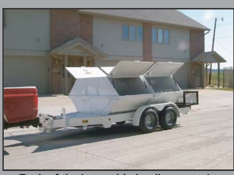
Each of the large side loading containers have dual gas prop assisted top hinge lids for easy loading and unloading.