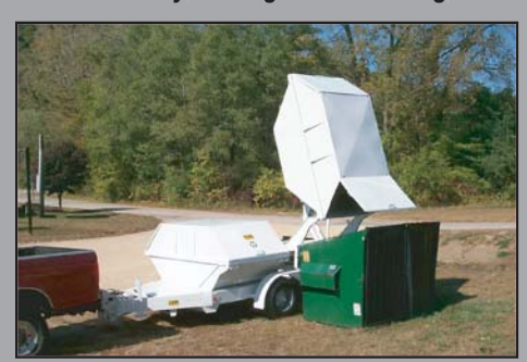
Side Dump containers dump independently.