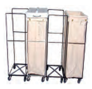
Coupling bars are available to join caddie frames together.