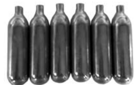
P/N: 40494-06 Bag of 6 each 16g CO 2 Cartridges

CO 2 cartridges 40490 Intended for use in blowing out clogged oil lines with our blow out gun 40428 or 40429, this product can be used in a variety of applications ranging from making seltzer water to use in CO 2 bb-guns.