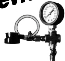
P/N: 2007CV Chem-Flush Valve

Our new Control Blast blow-out gun puts you in control with our new trigger activated technology. This new device uses a new bigger and better 12 or 16 gram CO 2 cartridge. Stock up today! Do not use on a closed end line.