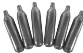
P/N: 40492-06 Bag of 6 each 12g CO 2 Cartridges