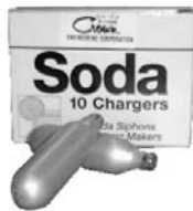
P/N: 40490 Box of 10 each 8g CO 2 Cartridges

Walker® Chem Flush Valve. This valve is required when using Chem-Flush - 1 aerosol P/N: 2001CF. The valve consists of a dispensing cap, flow sight tube, pressure gauge, pressure relief valve with a threaded portion for easy adaptation of a standard CO 2 gun.