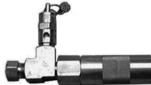
P/N: 404029 8g Blow out gun with relief valve