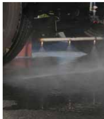
ABOVE The RT655