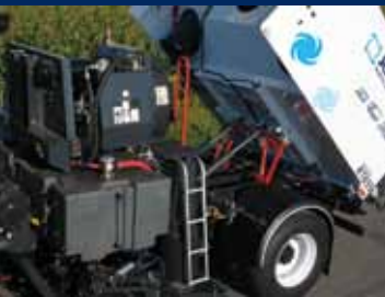
MIDDLE Full service access