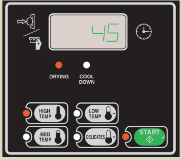
Micro Display Control Features: Digital display for vend price and cycle time countdown. Touch pad control with LEDs. Four cycle and heat selections, dedicated Push-to-Start pad.

Touch pad control with LEDs. Four cycle selections, dedicated Push-to-Start pad. Infrared programming.