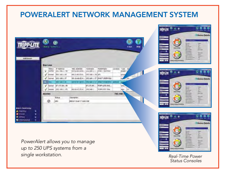
SmartOnline T3 UPS Systems support remote management through PowerAlert software or the SNMPWEBCARD accessory.

Offers convenient push button control and communicates operational modes, conditions and warnings.