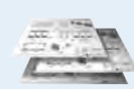
drawings & instructions