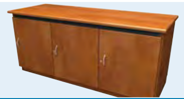
contemporary style, shown in aged cherry