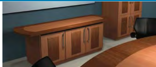
Using the New C5 Millwork Kit lets a custom millworker provide matching outer surfaces. (Not a standard offering)