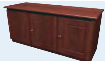
traditional style, shown in dark cherry