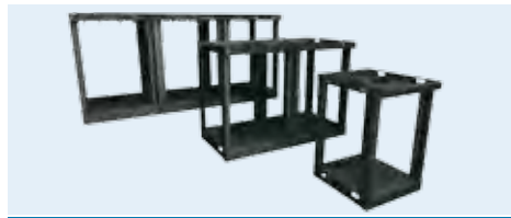
all frames ship fully assembled to save time

3-bay model showing stages of integration