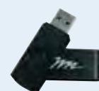
USB flash drive