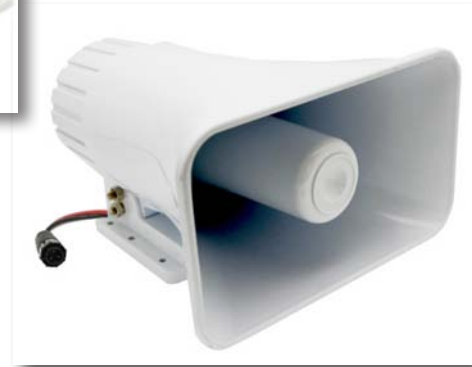
VNS2031 30 watts outdoor wireless PA/Bell Horn Speaker