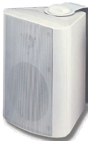
VNS2050 50 Watts Indoor/Outdoor Wireless PA/Bell Speaker