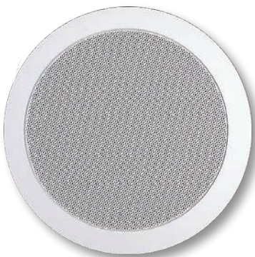
VNS2030 30 Watts In-Wall/Ceiling Wireless PA/Bell Speaker