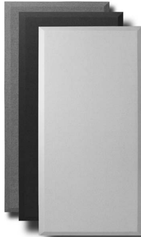
24" x 48" (610mm x 1219mm)

The large panel design also lends itself to other installations: To control bass in studio and home theater, thicker 2" and 3" Broadband Absorbers are combined with Corner or Offset Impalers to create an air cavity in behind the panel. For general office noise, thinner 1" panels are easily flush mounted on the wall surface using Surface impalers to attenuate the reverberant field. Broadway Broadband panels come in choice of 3 thicknesses and 3 colors: black, beige and gray and may be ordered with or without a beveled edge.