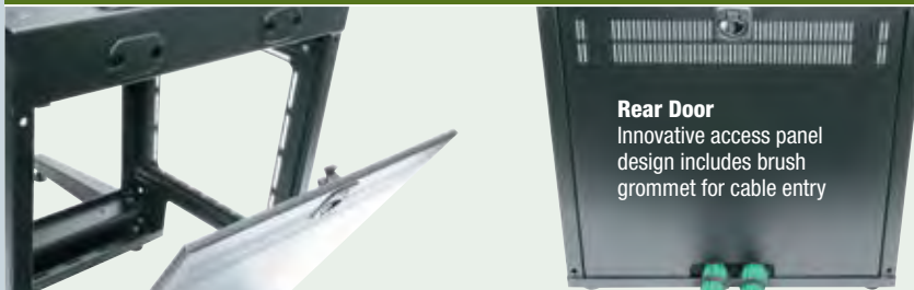
Rear Door Innovative access panel design includes brush grommet for cable entry

Lockable front and rear access panels can be hinged and/or lifted off easily, even while close to a wall, providing easy access to equipment and connections.