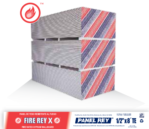
Gypsum Brand Tag

Panel Rey's Fire resistant drywall is a product formed by a fireproof core essentially made of gypsum and reinforced with the addition of high temperature resistant fibers. This provides a higher strength and fire resistance to the drywall when it is used in previously evaluated assemblies. The drywall is covered in both sides with 100% recycled paper. The paper, in the front, covers the beveled edges to strengthen and protect the core. The ends are carefully grinded in square cut. Panel Rey Fire Resistant Drywall is offered in one single variety of standard length and thickness to be used in the construction field. Panel Rey products do not contain asbestos.