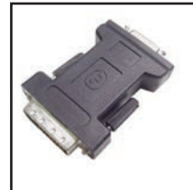
35-702 DVI-D Female to DFP 20 Pin Male adapter. 35-703 DVI-D Male to DFP 20 Pin Female adapter.