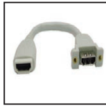
35-707 HDMI Female to HDMI panel mount Female 6 inch length. Hardware not supplied.