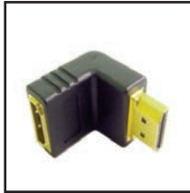
35-714A HDMI Female to Male right angle adapter. Down 270 degrees. Gold contacts.