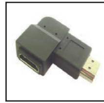
35-709 HDMI M-F Low profile right angle adapter for HDMI. Unique flat on side design. Gold plated.