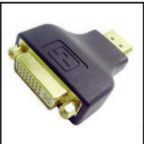
35-727 DVI-D Female to Male Display Port Male adapter.