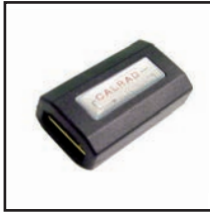
35-713-A HDMI Female to Female inline Coupler with Gold contacts.