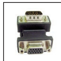
35-704 15 pin VGA Male to Female right angle adapter for projectors. Cable exits up from the jack.