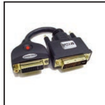
35-717 DVI-I Female to M1DA Male plug. Length 6" Gold plated contacts.