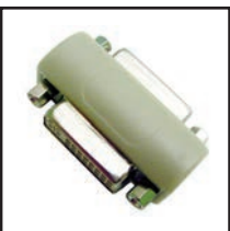
35-710A DVI-I to DVI-I Female to Female Coupler. Shielded di-cast case handles 5 pin analog and 24 pin digital signals. gold plated contact pins. Used for inline or chassis mount. Overall length .93" For wall mounting use Calrad p/n 30-598.