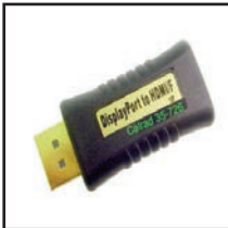
35-726 HDMI Male to Display Port Female adapter.