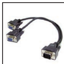
35-600 DB 15 VGA "Y" cable. 1 Male to 2 Females. 1 ft length. Gold plated.