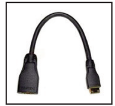
35-728 HDMI Female to Mini HDMI Type C Male adapter cable.