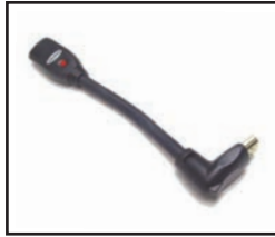
35-718, 35-718A HDMI Right Angle Adapter Cables The 35-718 Series Adapters provide a low profile cable exit solution for tight spaces Behind video displays, A/V receivers, switching and amplifier devices. Length 6".