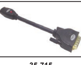
35-715 HDMI Female to DVI-D Male Cable Adapter. Gold plated contacts. 6" Length 35-716 HDMI Male to DVI-D Female cable adapter. Gold plated contacts. 6" Length.