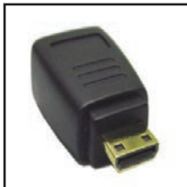
35-706 HDMI Female to mini HDMI Male adapter. Gold plated contacts.