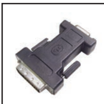
35-700 DVI-I Male to VGA DB-15 Female Adapter Allows you to connect VGA display to a DVI-I graphics card. Note, this adapter does not provide a digital to analog signal conversion. It will not work with DVI-D.