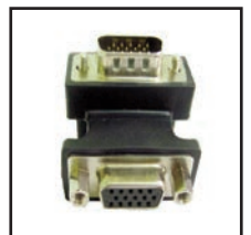
35-704A 15 pin VGA Male to Female right angle adapter for projectors. Cable exits down from the jack.