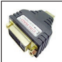
35-712A HDMI Male to DVI-D Female adapter with Gold plated contacts.