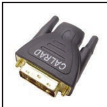
35-711A HDMI Female to DVI-D Male adapter with Gold plated contacts.