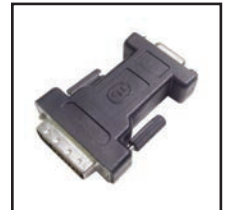
35-701 DVI-A Male to VGA DB-15 Female Adapter. This adapter allows you to connect a DVI-A display to a VGA graphics card.