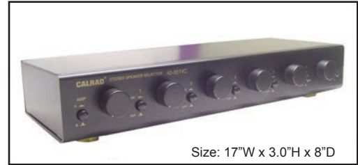
Size: 17"W x 3.0"H x 8"D

Rating per channel 100W, RMS continuous selectable A/B amplifier input. Multiple-position volume control: 10 position switch - max attenuation 42dB heavy duty. Push type connectors accept up to 12 awg. cable. Independent channel grounds for safe connection to all amplifiers (including bridged or floating ground). Load impedance resistors for amplifier protection. Size: 17"(W) x 3"(H) x 8"(D) front to back including knobs and terminal. Weight 12.5 lbs.