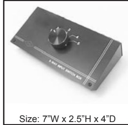
Size: 7"W x 2.5"H x 4"D

5 inputs to 1 output device. When more audio inputs are needed for a receiver/amplifier, provides switching for CD players, tape decks, tuners, VCR's, etc. Black steel cabinet with white labeling.