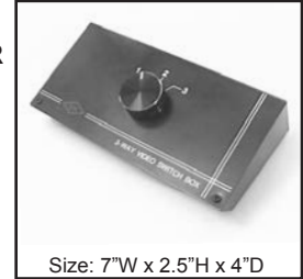
Size: 7"W x 2.5"H x 4"D

3 position rotary switch selects between 3 audio/video input signals and sends them to 1 output device. Black steel cabinet with white labeling.