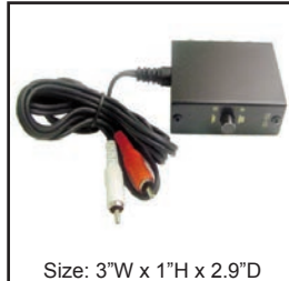
Size: 3"W x 1"H x 2.9"D

Enables 2 audio inputs to be switched to 1 output. Slim metal chassis with black finish. Mounts with velcro, included or double stick tape. 2 L+R inputs, Female RCA jacks. Output cable with L+R Male RCA plugs, 5' long.