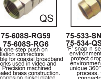
75-608S-RG6 Quick one-step push on installation connectors suitable for coaxial broadband data. Precision machined annealed brass construction. Anti-corrosion nickel plated finish. Used with multiple cable braid and shield types. RG59 or RG6 standard, tri-shield and quad shield cable. Internal neoprene O-ring provides a weather sealed connection. 7mm heavy duty easy-grip nut.