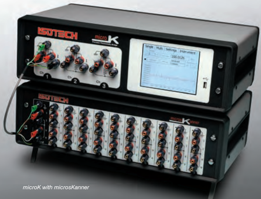
microK with microsKanner