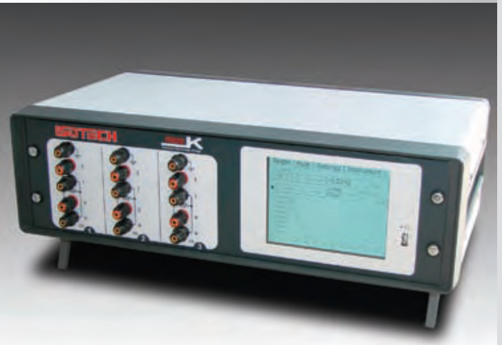
Unequaled combination of accuracy, stability and versatility.

"Performance by Design" was the mantra and passion behind the development of the microK. On Day 1 a decision was made, "no tweak pots" (such as used on AC Bridges to correct for flux leakage), no software adjustment, no "self-calibration" but performance by design. The microK achieves its resistance ratio accuracy by design, not adjustment and is uniquely drift free.