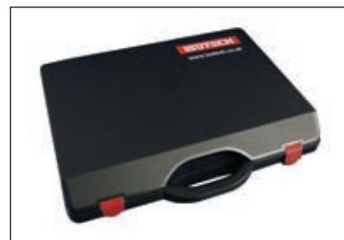
931-22-106 Optional Carrying Case

The TTI-22 includes Cal Notepad software for easy monitoring and logging of data. It is fully compatible with Isotech I-Cal Easy which can automate comparison calibration.