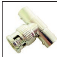
75-540 "T" adapter, 2 BNC Females to 1 BNC Male. 75-690 75 ohm version.