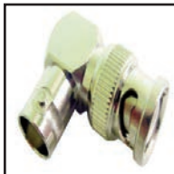
75-561 BNC Male to BNC Female right angle adapter. 75-693 75 ohm version.