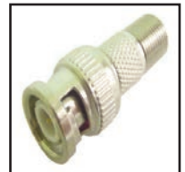
75-517 "F" Female to BNC Male adapter. 75-517G Gold version. 75-679 75 ohm version.