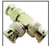
75-621 3-way BNC "T" BNC Male connectors.