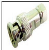
75-527 BNC Male to "F" Male.