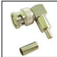
75-554 BNC right angle crimp connector for RG-58. 2 pcs.