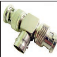
75-622 3-way BNC "T" Connector, with 2 Males to 1 Female.