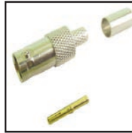
75-645 50 Ohm BNC Female inline connector for RG-59. 3 piece crimp.