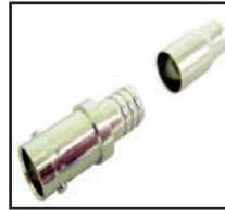
75-646 RG-59 crimp BNC Female 2 piece.