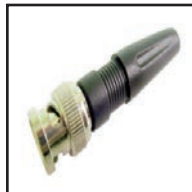
75-559-ST-75 75 ohm version 75-559-ST 50 ohm version Solderless BNC Male connector for use with RG-59 coax cable. Cable opening .24". Black snap style plastic body.