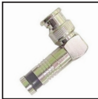
Right Angle Water Resistant Compression Style Connectors Nickel Version 75-533-PSBNCRA RG59 75-534-PS-BNCRA RG-6 Gold Version 75-533G-PSBNCRA RG59 75-534G-PSBNCRA RG-6

Please Note: For 75-533-PS & 75-534-PS Series, images and specifications are subject to change