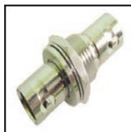
75-628 Isolated BNC feed thru. True 75 ohm. Overall length 1.29". Mounts in .5" D hole. 75-628-50 50 Ohm Version