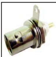
75-543 BNC Female chassis connector. Overall length is 1.08". Mounts in .375" chassis hole. Bushing length .28". 75-543G Gold version. 75-697 75 ohm version.