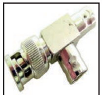
75-623 BNC "T" Connector, with 1 Male to 2 Females.