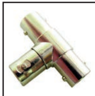
75-541 BNC "T" with 3 Female BNC connectors. 75-691 75 ohm version.