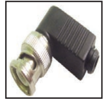
75-559-75 75 ohm version 75-559 50 ohm version Solderless BNC Male right angle connector for use with RG-59 coax cable. Cable opening .24". Black snap style plastic body.