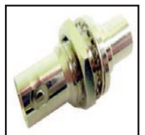
75-521 Panel feed thru connector. BNC Female to RCA Female. Bushing dia.: .487" Bushing length: .33" Overall length is 1.29" Mounts in .5" hole. 75 ohm. 75-521-50 50 Ohm version