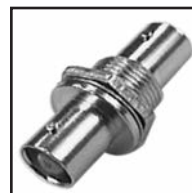
75-552 BNC feed thru double Female panel mount. Mounts in .5" D hole. Overall length is 1.28". Bushing length .33". 75-696 75 ohm version