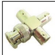
75-620 4-way BNC "T" Connector, with 3 Females to 1 Male.