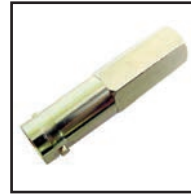
75-566 Inline BNC Female solderless screw on adapter for RG-58.