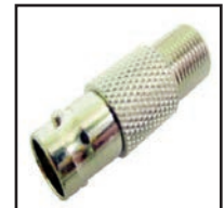
75-526 BNC Female to "F" Female.