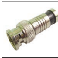
Water Resistant Compression Style Connectors Nickel Version 75-533-PS-BNC RG59 75-534-PS-BNC RG-6 Gold Version 75-533G-PS-BNC RG59 75-534G-PS-BNC RG-6 75-534Q-PS-BNC Quad Shield RG-6 Version