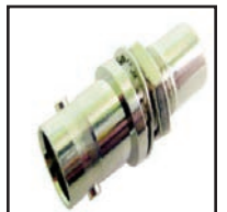
75-521-3/8 Panel feed thru connector. BNC Female to RCA Female. Bushing dia.: .365" Bushing length: .27" Overall length is 1.06". Mounts in .375" hole.