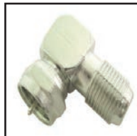
75-535 Right angle adapter. "F" Male to "F" Female.