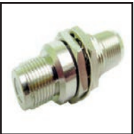
75-520DD-WH Silver plated "F" to "F" 3/8" type RF coupler. Double D cut with hardware