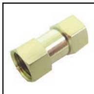
75-565 "F" Male to Male adapter.