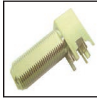
75-625 Right angle PC mount "F" connector with long shaft.