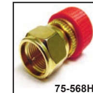
75-568 RF Terminator 75-568HQ High Quality Gold Male RF Terminator.

75 Ohm Male terminator. Easy finger grip design and solid center pin. Red ID band labeled 75 Ohm.