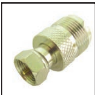
75-525 UHF Female to "F" Male.