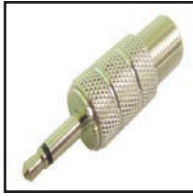
75-539 Adapter for TV, video and cable. Female F-81 Jack to Male 3.5 mm mini plug.