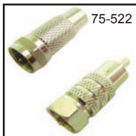
75-522 RCA Female to "F" Male.