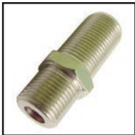
75-750 1 & 2 Ghz F-81 Feedthrus. 1Ghz for cable, TV, 2 GHz for satellite receivers 75-750-1 (1 GHz, 3/8") 75-750-1 (1 GHz, 3/8") Gold) 75-750-2 (2 GHz, 3/8") 75-750-2 (2 GHz, 3/8") Gold) 75-750-1/2-1 (1 GHz, 1/2") 75-750-1/2-2 (2 GHz, 1/2") 75-750G-1/2-1 (1 GHz, 1/2") Gold) 75-750G-1/2-2 (2 GHz, 1/2") Gold) 75-750-3 (3 GHz, 3/8")