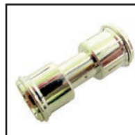
75-565-PO "F" Male to Male Push-on coupler