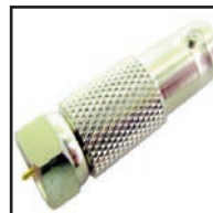
75-528 BNC Female to "F" Male.