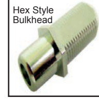
75-635A-COLOR Female "F" to RCA Female Same as 75-635 only with hex style bulkhead. Available with colored RCA dielectric. Specify color when ordering. Available in Black, Blue, Green, Red, Yellow and White.