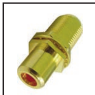
75-635AG-COLOR Female "F" to RCA Female Same as 75-635A hex style Gold Version Bulkhead. Available with colored RCA dielectric. Specify color when ordering. Available in black, blue, green, red, orange, yellow, and white.