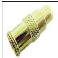
75-532 RCA Female to "F" push-on Male.