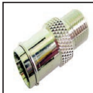
75-530 Push-on adapter. "F" Male (push-on) to "F" Female.