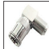
75-535-PO Right angle, push-on "F" Male to "F" Female.