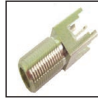
75-531 Circuit board mount "F" Female type. 75-531G Gold version. Mounts in .375" chassis hole.