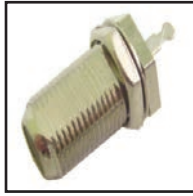
75-604 Chassis mount "F" Female connector. Mounts from rear with hardware. Mounts in .375" chassis hole.