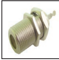
75-519 F-61A type chassis connector. Female "F" mounts in .375" chassis hole with nuts & washer.