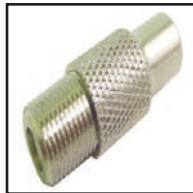
75-556 "F" Female to RCA Female.