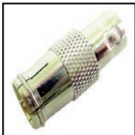
75-567 BNC Female to Push-on-F Male connection.