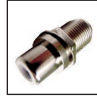
75-635G Gold Female to RCA to "F" bulkhead connector. Panel mount double "D" connector mounts in 3/8" hole. Overall length .95". "F" thread length .57". Mounting hardware included.