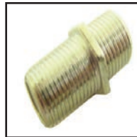
75-520 F-81C type coupler. "F" to "F" type coupler. Mounts in .375" chassis hole. 75-520 3/8" standard 75-520G 3/8" gold version 75-520-1D 3/8" single D cut 75-520-2D 3/8" double D cut 75-520-WH with hardware 75-520-1/2 1/2" version 75-520G-1/2 1/2" gold version