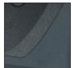
Rubber Sleeve The TTI-10 Handheld Thermometer is supplied with a protective rubber boot.