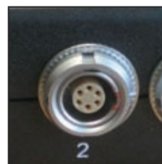
Input Connectors Highest quality latching metal 'Lemo' connectors.