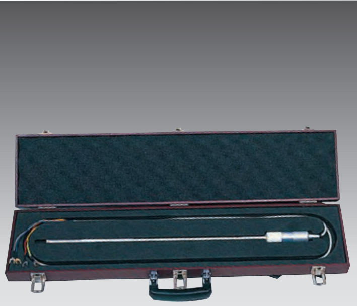
Super Stable Standard Platinum Resistance Thermometer

The 670SQ 650mm long is our recommended SPRT offering ultra stability, and has superior vibration, shock, immersion and self heating characteristics. From the success of the original Model 670 SPRTs we have introduced new models into the 670 range offering metal sheathed and low temperature models.