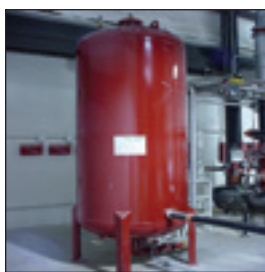
Foam Bladder Tanks