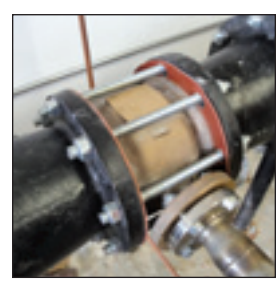
Foam Concentrate Proportioners