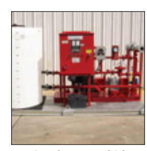
Diesel Pump Skids