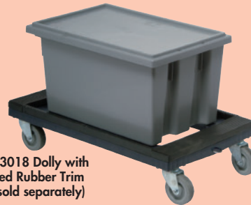
HDLY-3018 Dolly with Padded Rubber Trim (tote sold separately)

High density polypropylene, injection molded for uniform wall thickness and added strength. Lids snap tightly and securely for a safe fit. Quick 180° turn offer space-saving stacking and nesting. Stacks 6 high. Fits 48" x 40" pallets (6 SNT190, 4 SNT230 per level). Usable in temperatures from -10° to 250°F. Available in (GY) Gray, (BL) Blue or (RD) Red – please specify. Sold in carton quantities. Optional clear, see-thru Stack and Nest Label Holder (HSNH010). FOB Shipping Point.