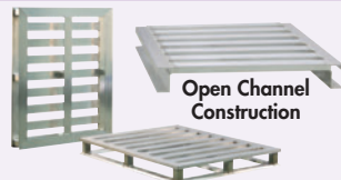
Closed Tube Construction

Lifetime warranty against rust and corrosion. Custom sizes are available -- call dealer for more information. FOB Shipping Point.