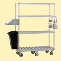
"Build Your Own"