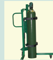
HF89739 Harrier Attachment