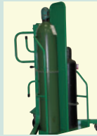
HF89737 Torch Attachment