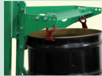
HF89736 Hook Attachment