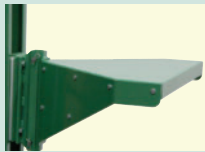
HF89735 Platform Attachment in Bench Position