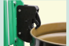
HF89740 Beak Attachment