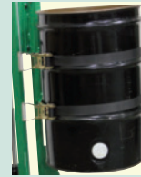
HF89738 Strap Attachment