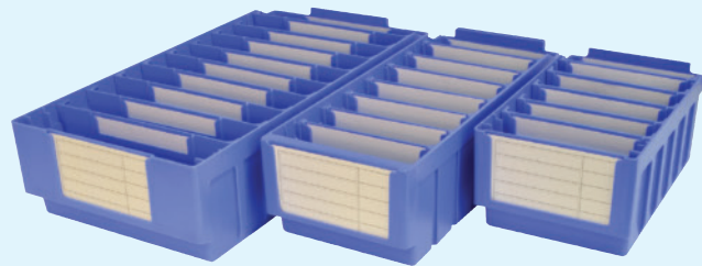
Bins Shown With Optional Dividers