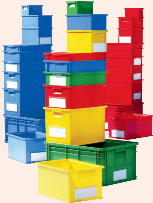
14/6 STRAIGHT WALL BINS

Extra durable double-wall construction, made of HDPE. Available in Blue (-BL), Red (-RD), Yellow (-YL), or Green (-GN) -- please specify. FOB Shipping Point.