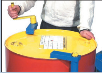
TILT-TO-LOAD DRUM ROTATOR