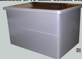
D) HGY-ST, HVT-20