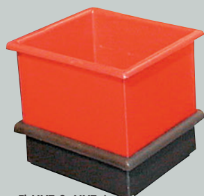
F) HHT-3, HHT-6