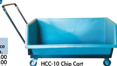
HCC-10 Chip Cart