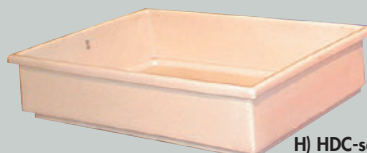
H) HDC-series containers