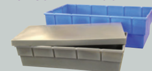
A) HBC-3616-L, HBC-4721-L