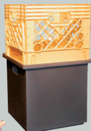
I) HTF-14 (shown with standard milk crate)