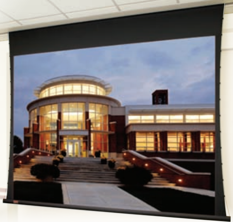
DePauw University's Green Center for the Performing Arts—Greencastle, IN.