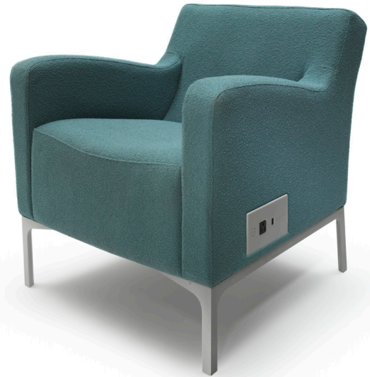
Plus Arm Chair with Power Left SPG910PL-

All Plus soft seating products are proudly made in the USA.