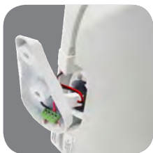
Pre-wired Euroblock male connector with four screw terminals concealed in the base of the Infin-A-Ball™ bracket for hidden wiring.