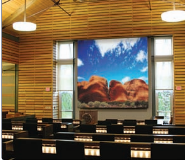
Targa with large style case at DePauw University's Prindle Institute for Ethics. LEED® Silver certified.