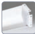
Large style Targa case

Dimensions, drawings and specifications at: www.draperinc.com/go/Targa.htm