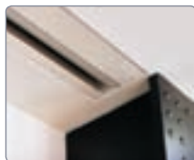
Signature open, prior to screen appearing.