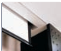
Signature with screen descending.