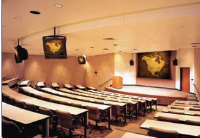
Marten House Hotel and Lilly Conference Center. Both of Indianapolis, IN.