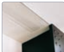
Signature with closure panel.