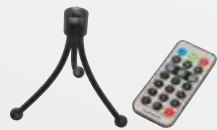
2 mounting stands and remote included