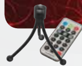
2 mounting stands and remote included