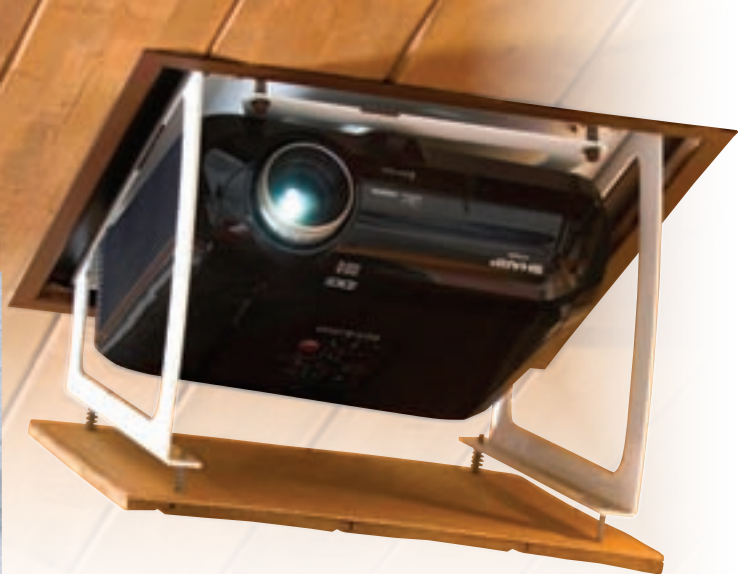
Phantom installation by Harmony Interiors, featuring a custom ceiling closure.