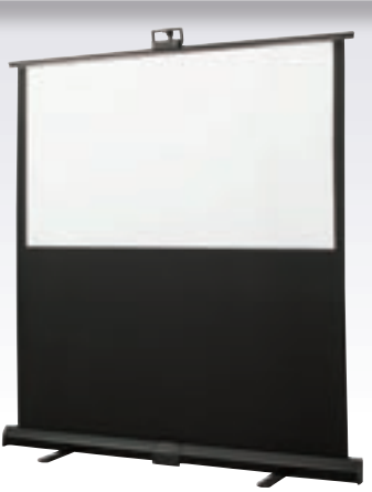
Piper open and ready for the show.