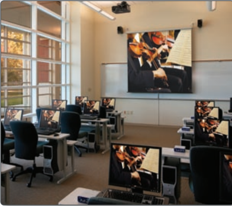
DePauw University, Greencastle, IN.