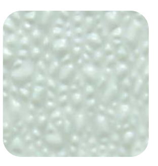
ArmorTuf-NXT with a resin rich surface

ArmorTuf-NXT's surface is more stain resistant and easier to clean than thermoplastic panels. This is due to the chemically bonded, crosslinked resins, resulting in a harder, more robust panel surface. Thermoplastic panels are heat bonded and result in a softer surface with surface voids that attract dirt and moisture.