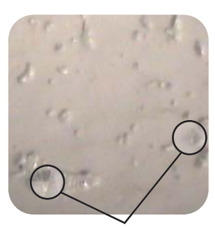
Thermoplastic with a porous surface which can trap dirt and moisture