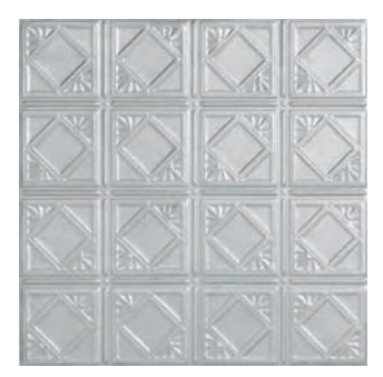
Fans* 5422207 Lay-in 5424207 Nail-up