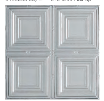
Medium Panels 5422320 Lay-in 5424320 Nail-up