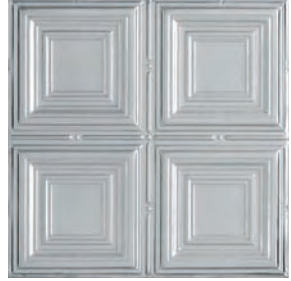
LS - Lacquered Steel