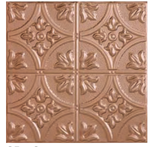
CP - Copper