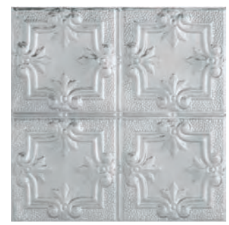
Hammered Trefoil 5422321 Lay-in 5424321 Nail-up