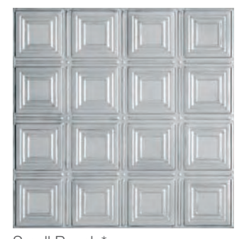
Small Panels* 5422204 Lay-in 5424204 Nail-up

Make a bold and contemporary design statement. Or create a quiet ambiance with subtle and sophisticated patterns evoking the essence of another time.