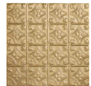
AR - Brass