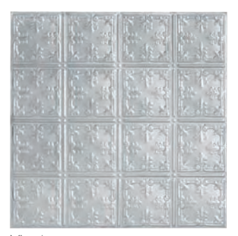
Vine* 5422210 Lay-in 5424210 Nail-up