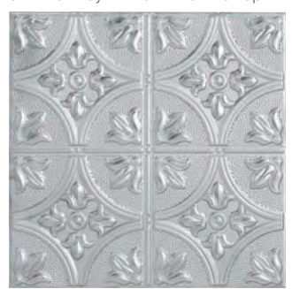
Large Floral Circle 5422309 Lay-in 5424309 Nail-up