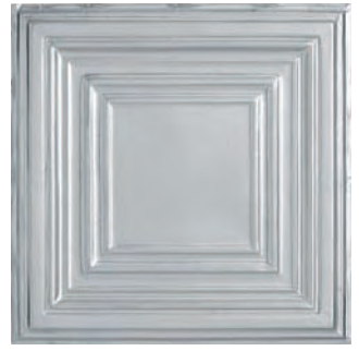
Large Panel 5422505 Lay-in 5424505 Nail-up