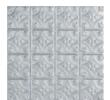
Small Floral Circle* 5422209 Lay-in 5424209 Nail-up