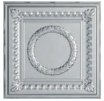
Wreath 5422503 Lay-in 5424503 Nail-up