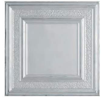
Hammered Border 5422509 Lay-in 5424509 Nail-up

*These styles are also available in 18.5" x 48.5", stainless steel backsplash panels.