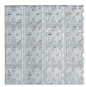
AM - Chrome