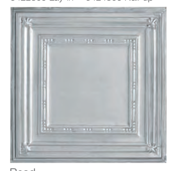
5422504 Lay-in 5424504 Nail-up