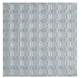
Medallion* 5422234 Lay-in 5424234 Nail-up