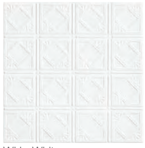
WH - White

Metallaire is available in five finishes. Choose one that complements the space's existing color and architectural features. Or choose a finish that will be the focus of all